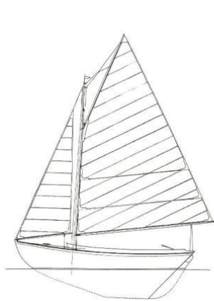
HERRESHOFF BULL'S EYE