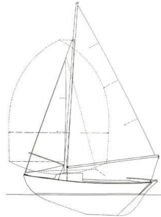
CAPE COD BULL'S EYE