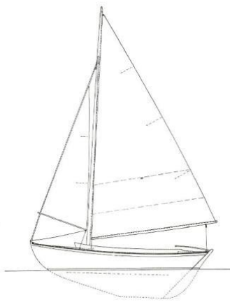
FISHER'S ISLAND SOUND BULL'S EYE