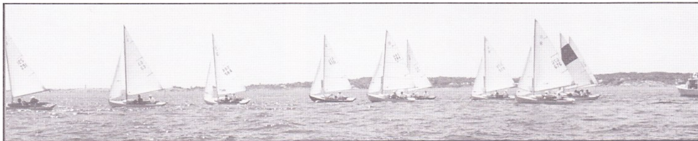
Ten of 14 starting in the Nationals. From left to right: Whisper II, Day Spring, Celtica, Acadia, Seasaw, Querida, Good Shot, Laurelei, Dream Days, and a leech of Consultation.