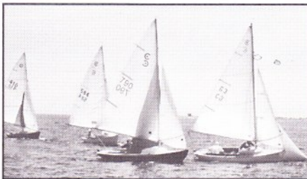
A parade of the best! L-R, Acadia (Desmarais), Celtica (Wohler-Berry), Red All Over (Goodwin-Kelley), led by Day Spring (Patterson). Note heavy air.