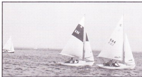
In hot pursuit! Or were they just overtaken? Dream Days (Nuttings) on the left, Celtica (Berrys) on the right. Red All Over in the distance.