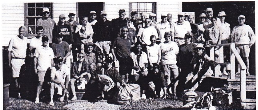
We're ready! After the Skippers' Meeting the first morning. All aboard!

Everyone went away with the hope that fair winds in their own lives will put them on the starting line at the 37th Nationals scheduled for Marion, Massachusetts next summer.